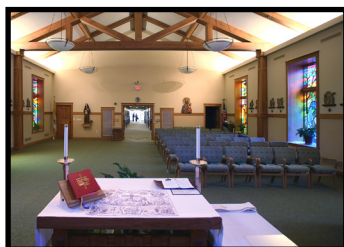
Blessed Angela Chapel, Felician Village

Worship can be a channel for recalling the past, creating feelings of comfort, familiarity, and spiritual fulfillment. The music, singing, scripture, sermons, prayers, and rituals included in Simply Worship are designed to spark a faith-filled response to God in persons with dementia. Worshipers can experience and respond to the presence of God in their lives.